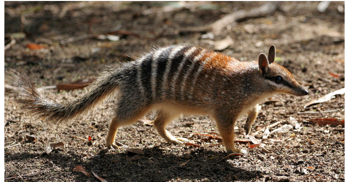
A NUMBAT IN THE PERTH ZOO