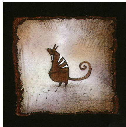
SHAUN TAN'S "NUMBAT-LIKE CREATURE"